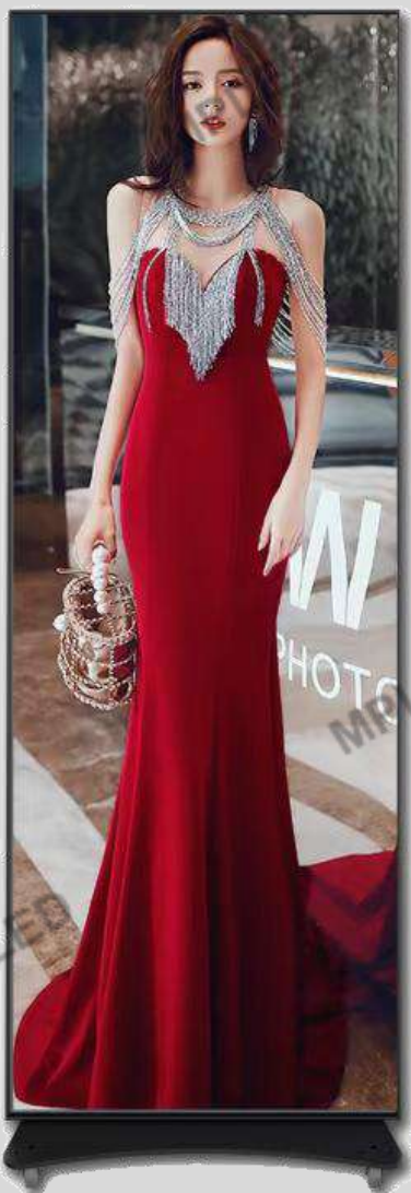
Floor stand with wheels