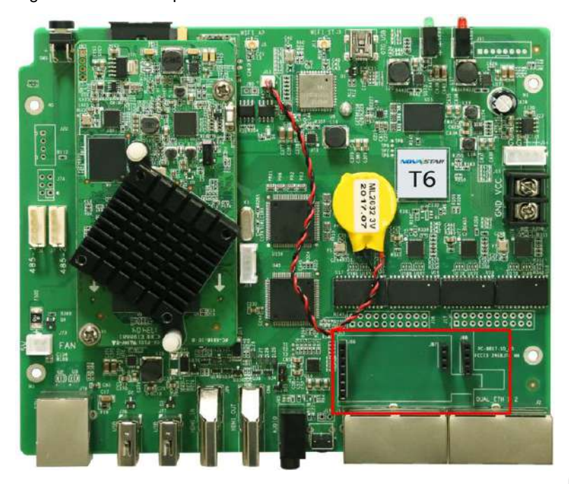
Figure 3-3 Installation position